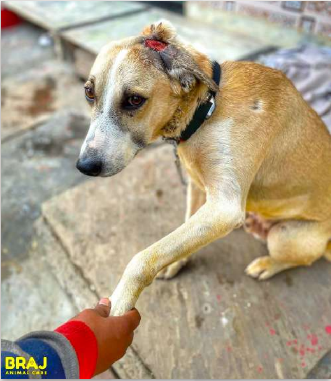
Tiger, looking better after several treatments

Unfortunately, some neighbours thought that Tiger had rabies, although he showed no symptoms of the disease. Some of them even considered poisoning him. As a result, the person who had initially called us decided to take Tiger to the nearby city of Mathura and