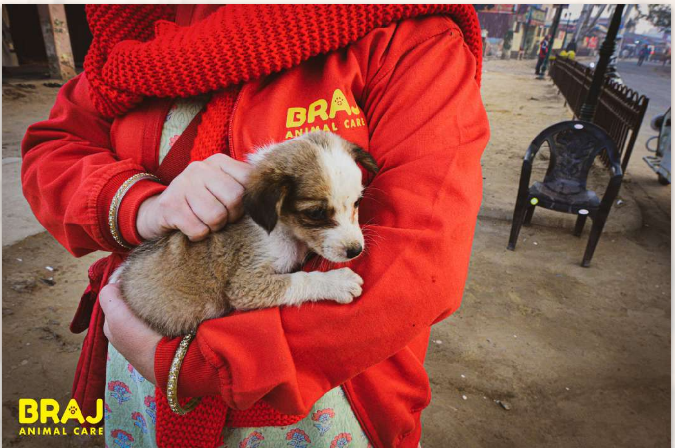
A Braj Animal Care puppy patient