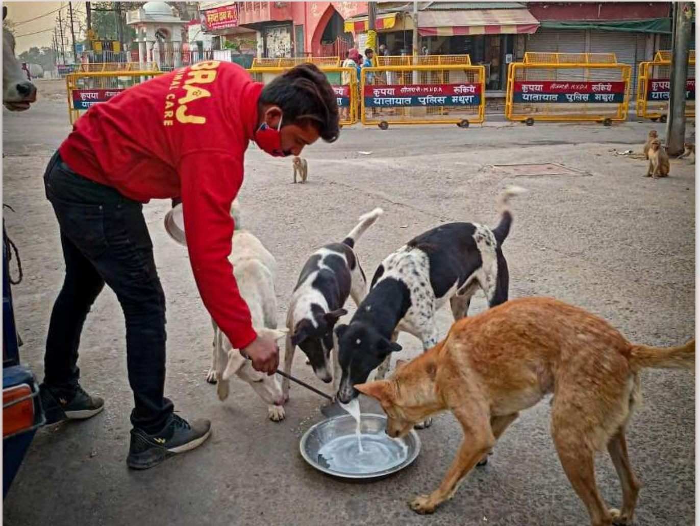
Braj Animal Care feeds street animals daily