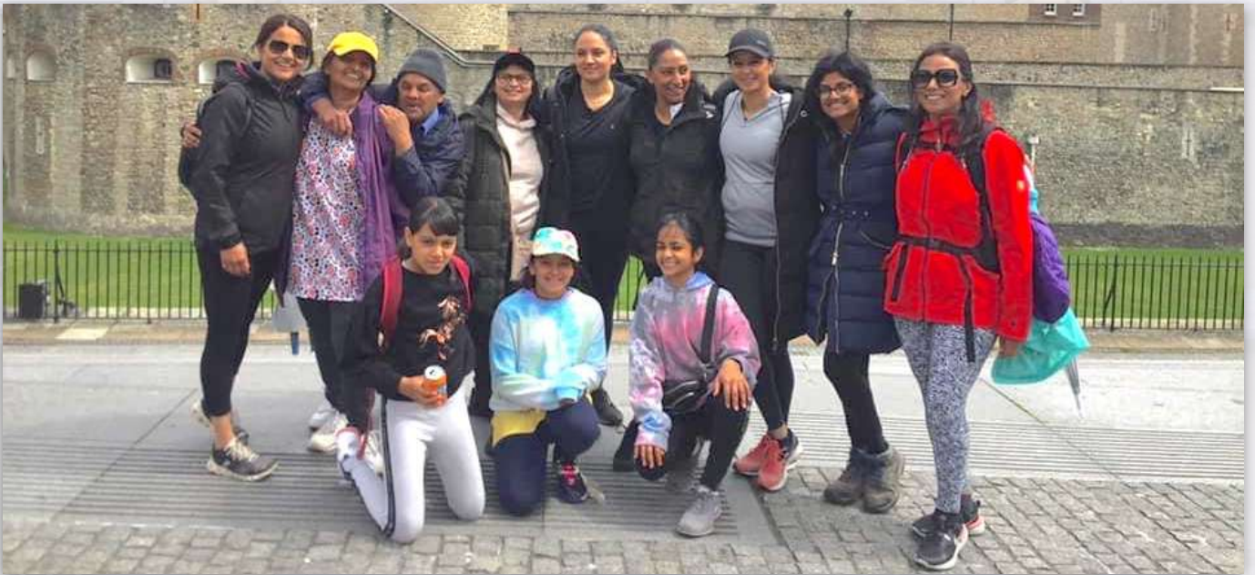
Participants of the fundraising walk in London