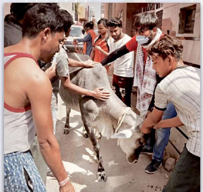
Our team and other locals with the rescued cow

Recently, the Braj Animal Care team were involved in an unexpected case involving a cow who was stuck on top of the roof of a Brajwasi's home. She had managed to climb a narrow staircase leading to the roof, where efforts were made to lead her back down the stairs, but the cow was fearful and resisted. Then, our team created a harness made from ropes and with the help of almost 20 other locals, lowered the cow over the side of the building. We're pleased to report that she was unharmed and is doing fine.