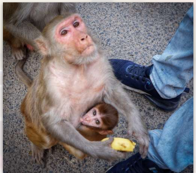
Animals on our new feeding route enjoying fruits