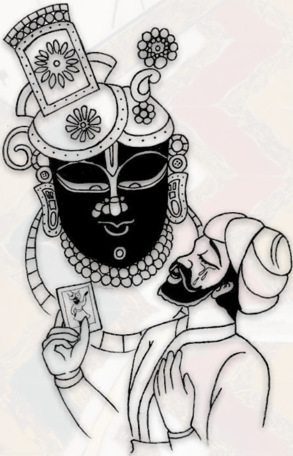
Shrinathji and Raskhan

One day, two devotees saw Sayed passing by. One of them whispered excitedly, "Sayed's passion is so sincere! He doesn't care what anyone thinks of him, and he is ready to risk everything for his beloved! If only we had that kind of attachment for Shri Krishn!" The other devotee was shocked by the thought, leaving him with a strange expression on his face.