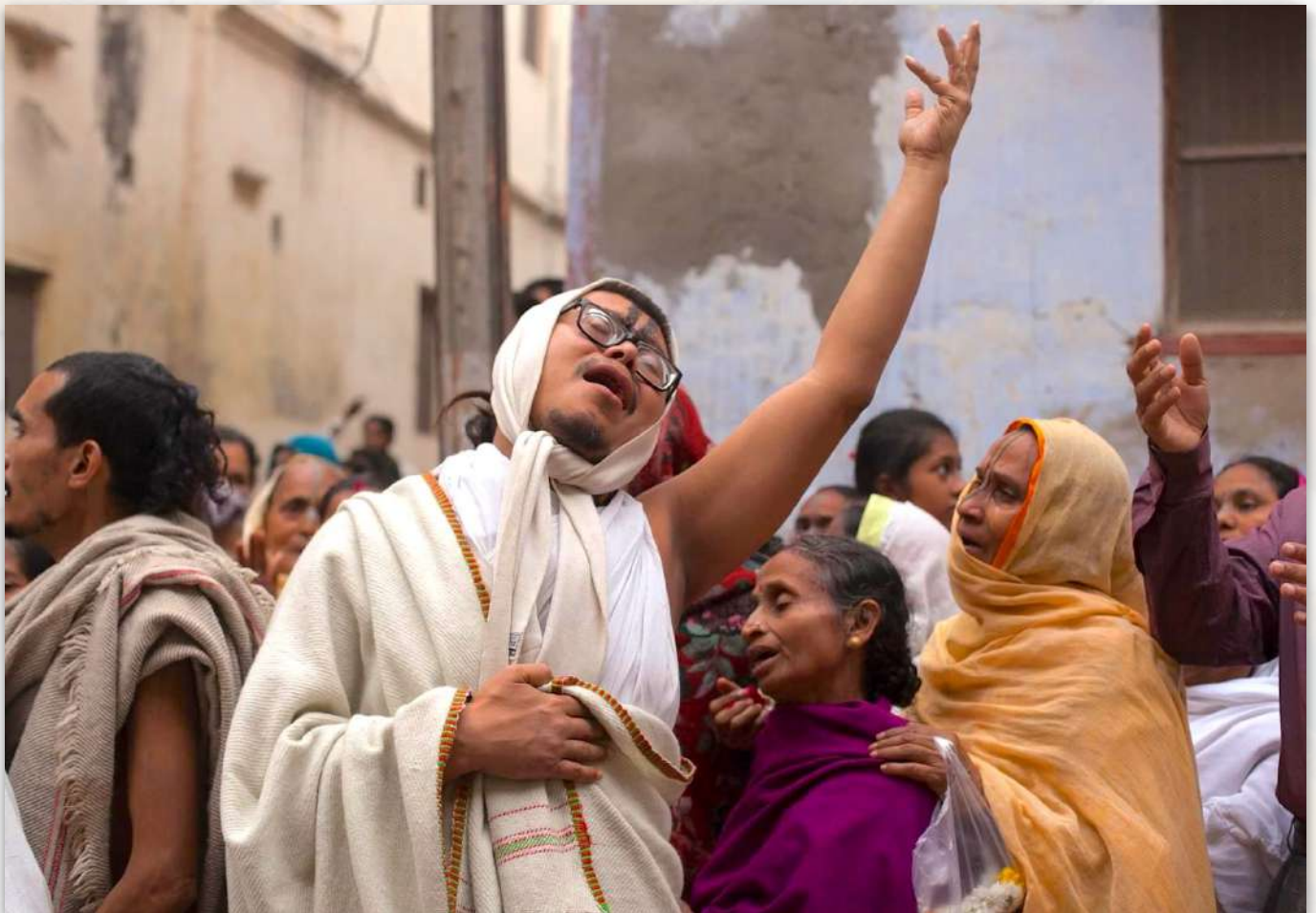
Devotees singing kirtan as part of the Kartik Purnima procession