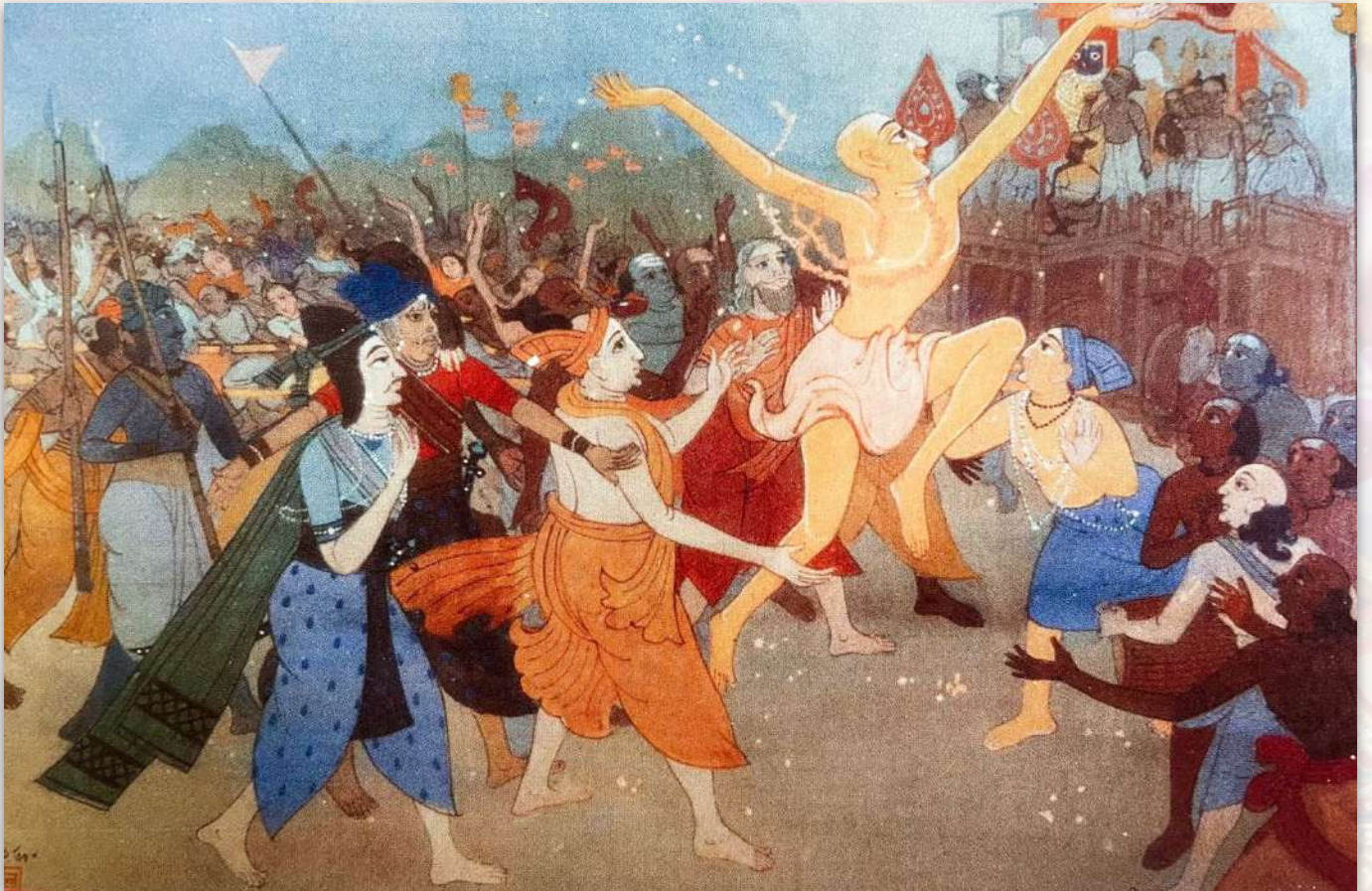
Mahaprabhu and devotees celebrate rath yatra

Following Mahaprabhu's instructions, Roop Goswami wrote many of the texts that now form the foundation of the Gaudiya Sampradaya's philosophy. Shri Narottam Das Thakur calls him, "The one who established Mahaprabhu's heart's desire in this world."