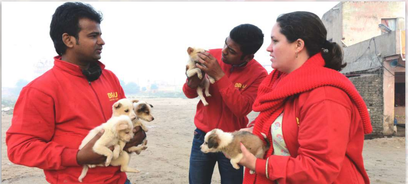
The parking lot puppies with members of the team

For the last year and a half, Braj Animal Care has been looking after a litter of puppies who live in a parking lot in front of the Shri Madanmohan Temple. When they were born, their mother, Safedi, had trouble producing enough milk, so we purchased special puppy formula to supplement their diet. For several months, a sadhu who lived nearby helped us administer the formula to the puppies several times a day. We also vaccinated them and checked in with them regularly. As a result of all these efforts, four out of five puppies survived.