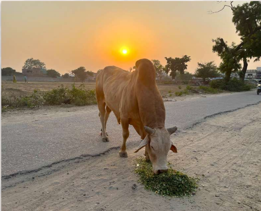
A Brajwasi cow enjoys a Braj Animal Care feeding

Blessed are the cows of Braj, who sustain their lives on the grass of Vrindavan's groves. Everyone knows that Krishn himself walks by their side and guides them through the pasturelands. In fact, every single cow here is Krishn's ansh (a partial form of him). Eternal Vrindavan is their home and Krishn's divine Brajwasis always caress them with love. The poet Nagari Das feels supremely fortunate just to receive a drop of their milk as prasad .