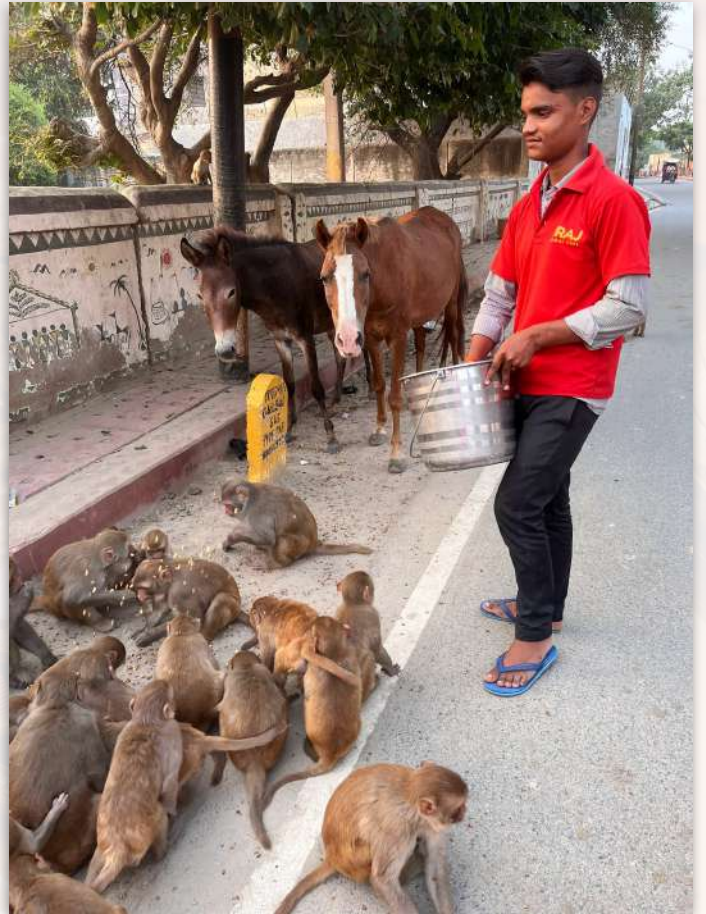
A team member feeding street animals