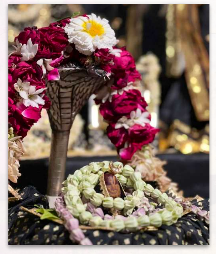
Puja on Mahashivratri

It is also Gaur Purnima, the appearance day of