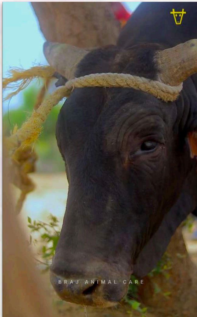
The bull that was attacked

f @braj.animal.care brajanimalcare.com (+91)8923737924 brajanimalcare@gmail.com