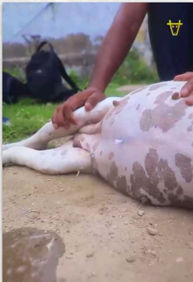
Chabili receives treatment