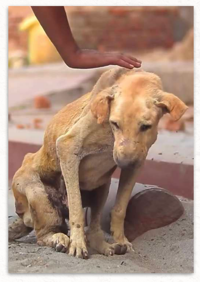
Baloo receiving some love from Braj Animal Care

For more information about Braj Animal Care's programmes and services, please keep in touch with us via the following channels: