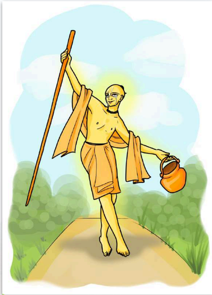
Mahaprabhu in his sannyasi form