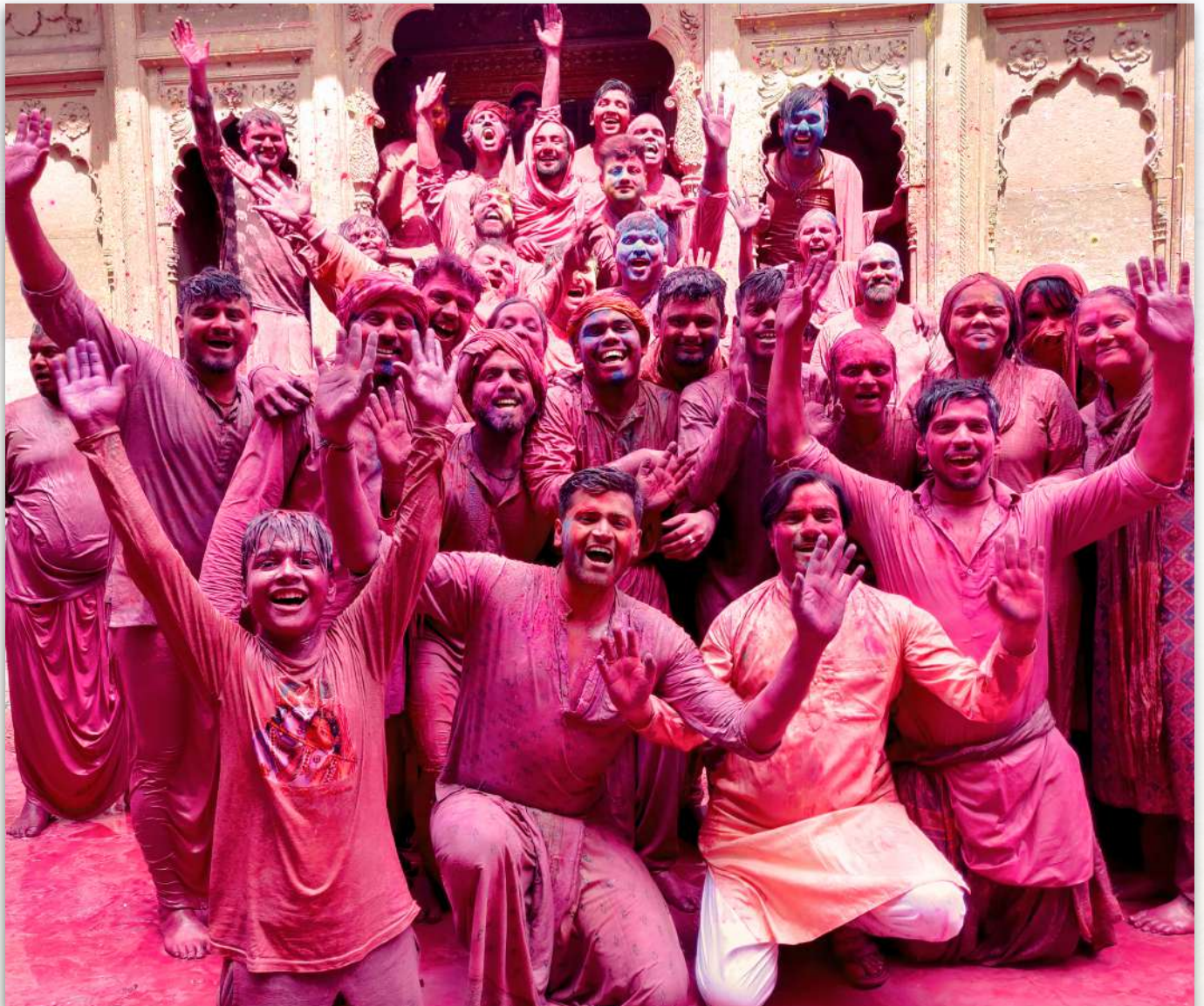
Devotees play Holi in the Radharaman Temple campus