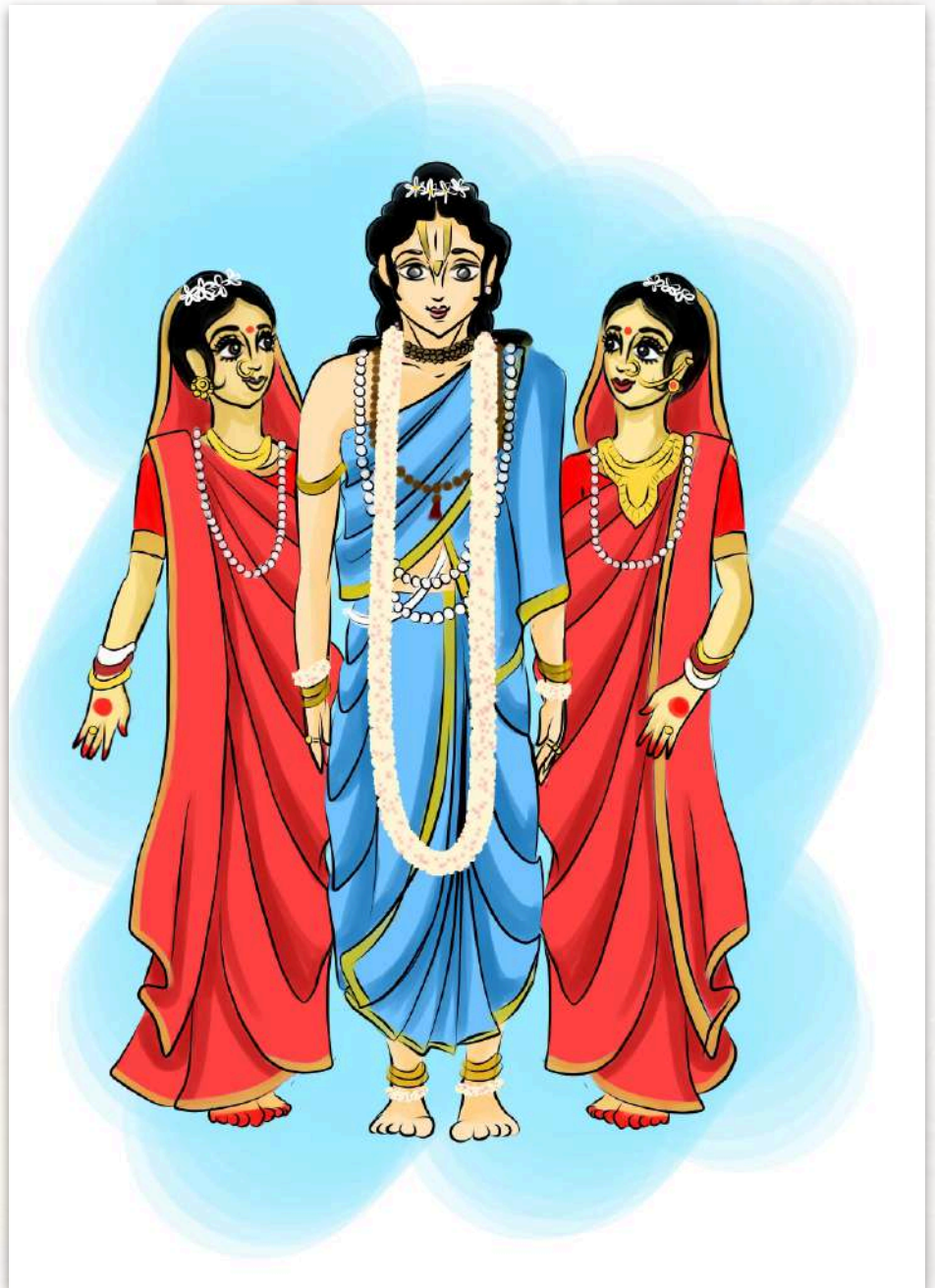
Nityanand Prabhu with Maa Jahnva and Vasudha

Suryadas brought Nityanand back to his home to find Vasudha's body laid at the gate, covered with a white cloth. When Nityanand came near, his fragrance flowed over her and she returned to life. Soon after this incident, Vasudha and her younger sister, Jahnva, were both married to Nityanand. According to the Gaur Ganoddesh Dipika (65-66), Vasudha and Jahnva were both avatars of Anang Manjari, combined with Balram's wives Varuni (Vasudha) and Revati (Jahnva).