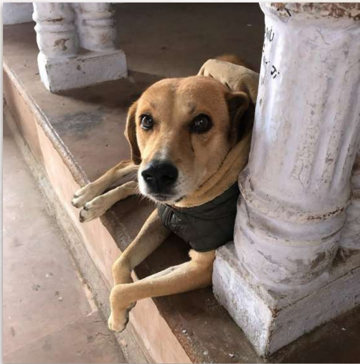
Sheru at Shri Radharaman Ghera

Sheru was born around 2009 to Jimmy (also known as Madhavi Dasi), a small white female dog residing in Radharaman Campus. His usual territory stretched from the Temple door to Radharamanji's Raas Mandal. He survived on bits of Radharamanji's prasad and scraps from the homes of Radharamanji's Goswamis. The dust of Braj served as both his plate and his bed.